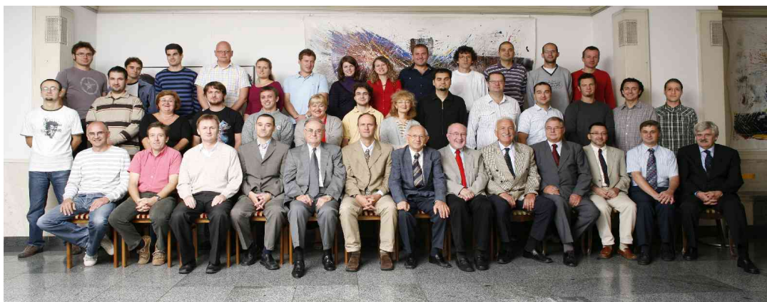
Members of the Department, June 2010.

Department of Electronic Systems and Information Processing Faculty of Electrical Engineering and Computing University of Zagreb Unska 3, 1000 Zagreb, Croatia